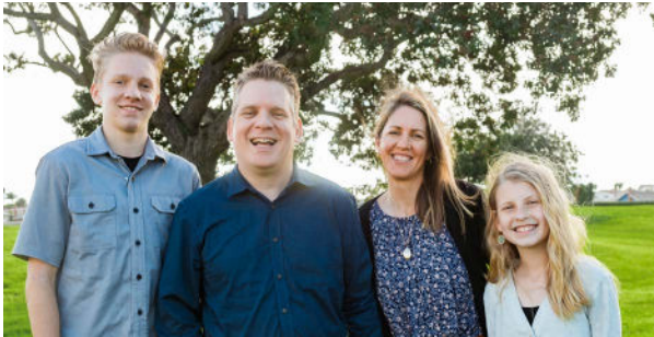
The Kramers Netherlands