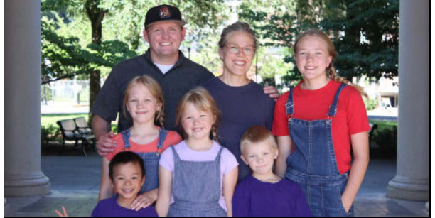
Chi Alpha (XA) Campus Ministries